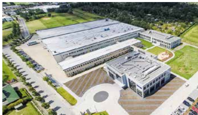
Manufacturing facility in Cuxhaven, Germany

VOCO GmbH Anton-Flettner-Straße 1-3 27472 Cuxhaven Germany