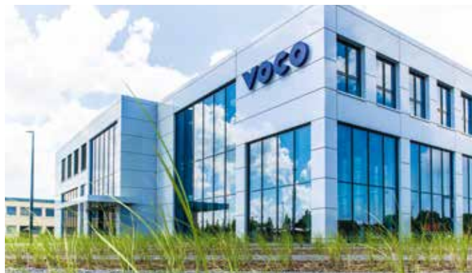
Training and Education Center in Cuxhaven, Germany